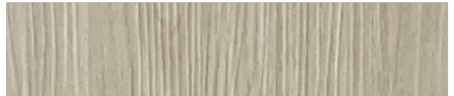
S-301 - Oak Ice