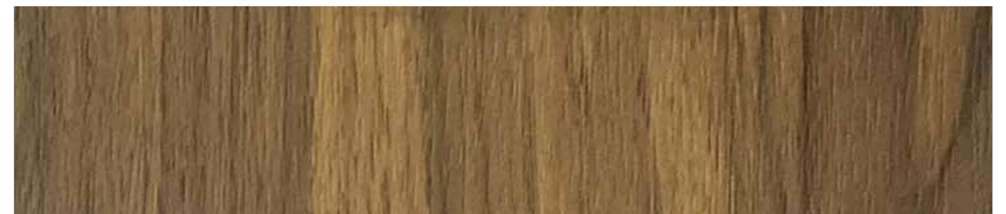
S-395 - Oak Radiant