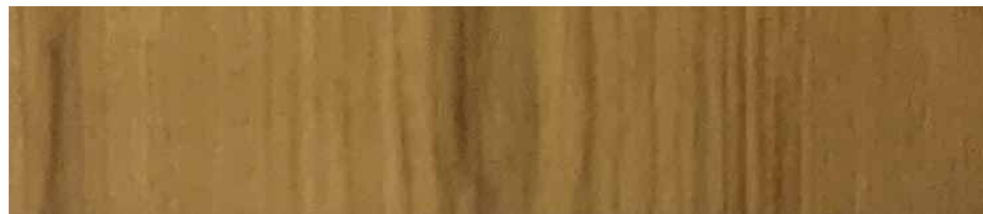
S-303 - Oak Honey