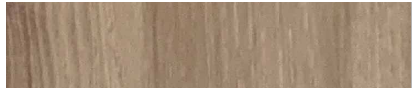
S-313 - Teak Light