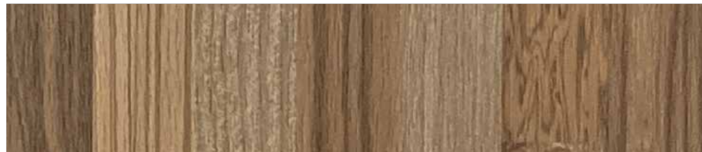
S-322 - Loft Chestnut