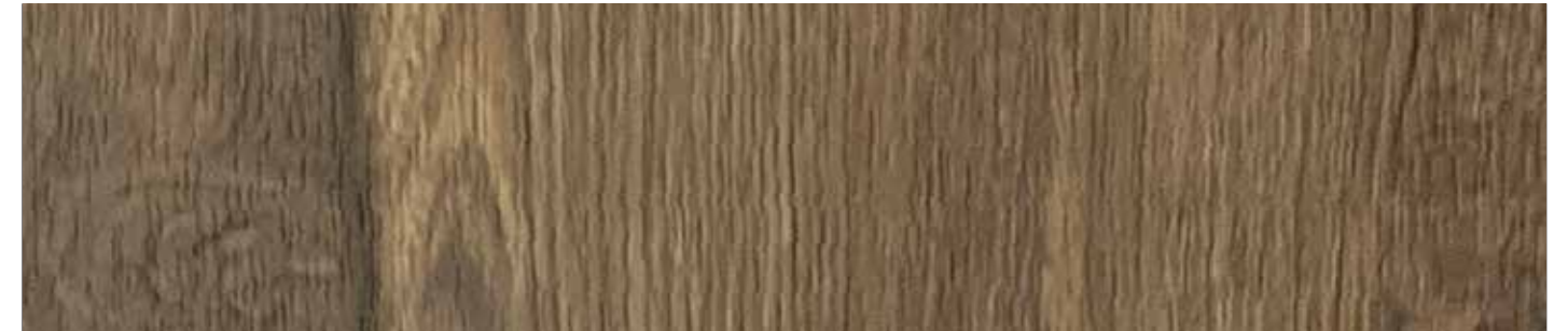
S-355 - Brown Oak