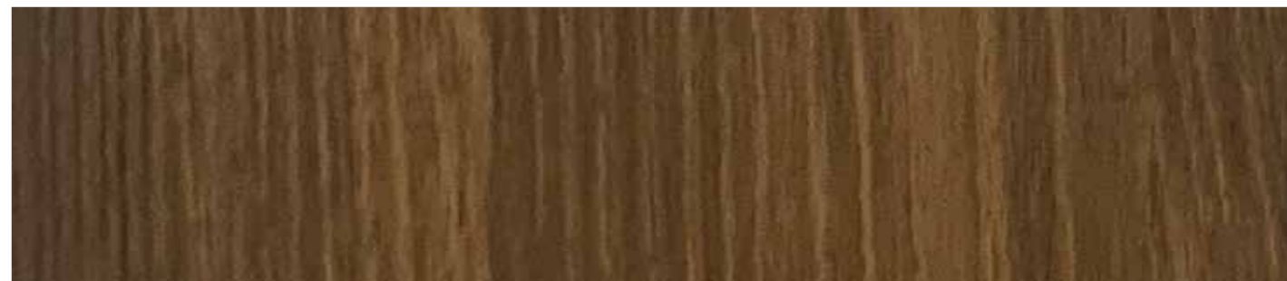
S-314 - Brownie